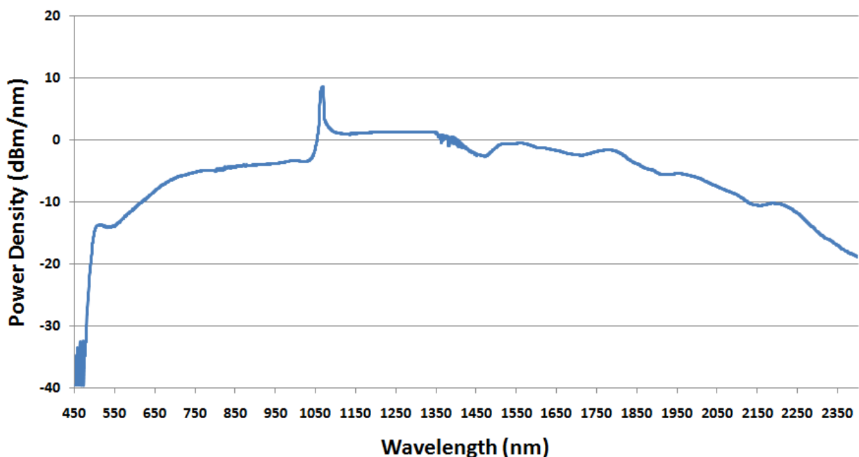
SC-5 Typical Spectrum