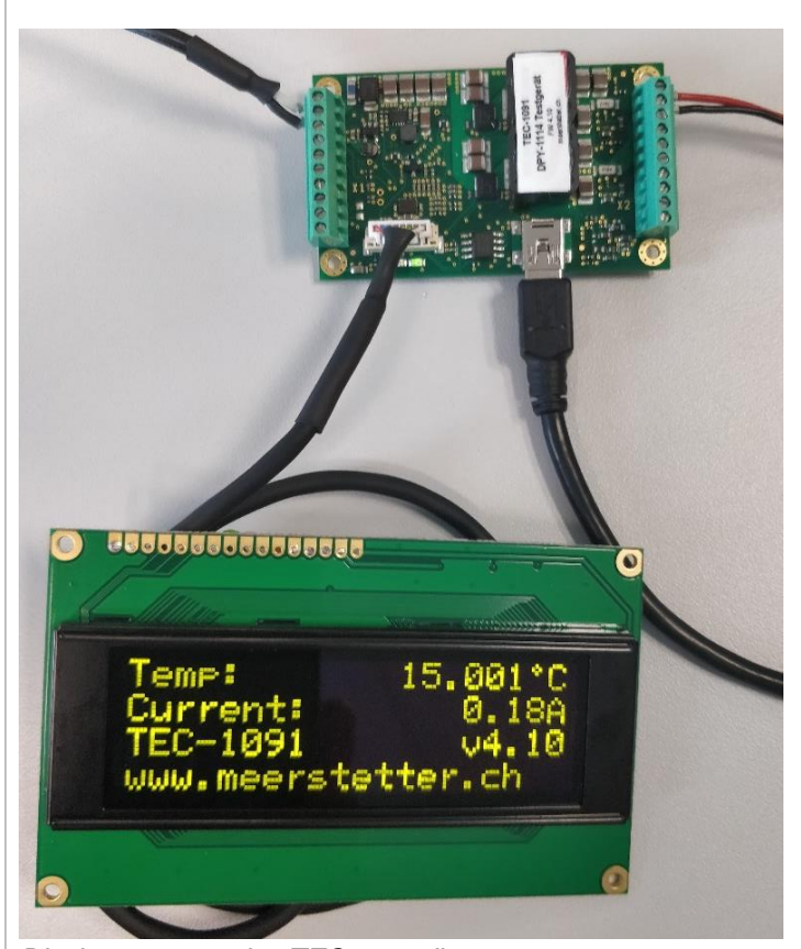
Display connected to TEC controller